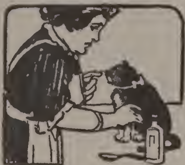
Rubbed Her Throat With Liniment.

“PUSSY hated home. She liked to go off with all the other cats of the neighborhood. And yet the funniest part was that Pussy’s home was so delightful. She had as nice a home as any little cat could wish for. She lived with her mother and two little sisters and brothers in a kitchen which was part of a very fine house.